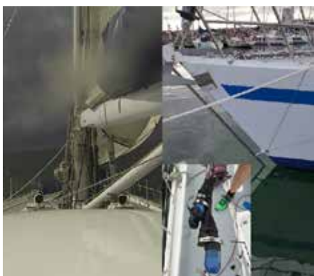
Fig. 2: Sensors to measure oxygen, salinity, temp, pH and pCO 2 were installed on a stainless steel pole that was attached in the bow of S/Y Hrimfare. Data from the sensors and the position from the boats GPS were logged every 20sec by a SmartGuard sensor hub. The entire installation took about 2 hours.