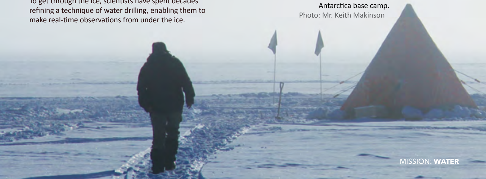
Antarctica base camp.

Not an easy task for the faint of heart.