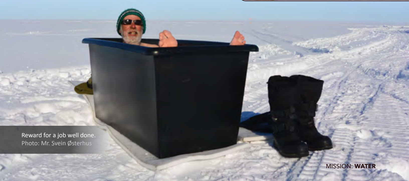
Reward for a job well done.