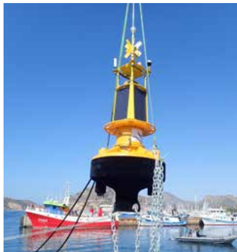
Fig. 3: MOTUS Wave Buoy