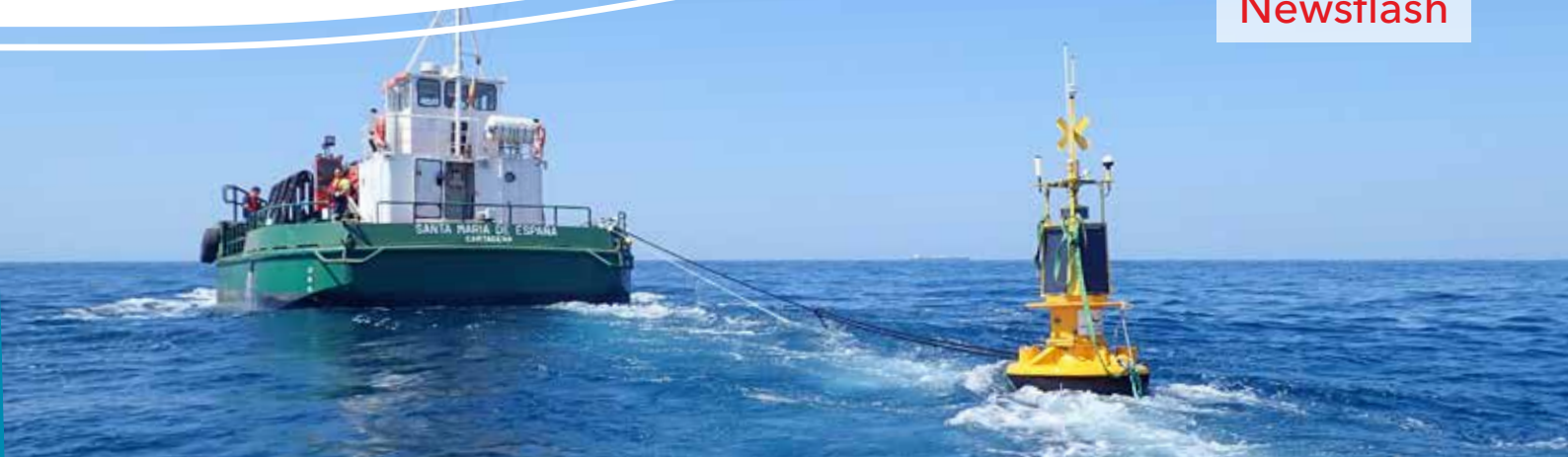
Fig. 1: Deployed SB-138 P buoy equipped with MOTUS wave sensor, DCPS, GMX200 weather sensor, and ATON AIS Type 3