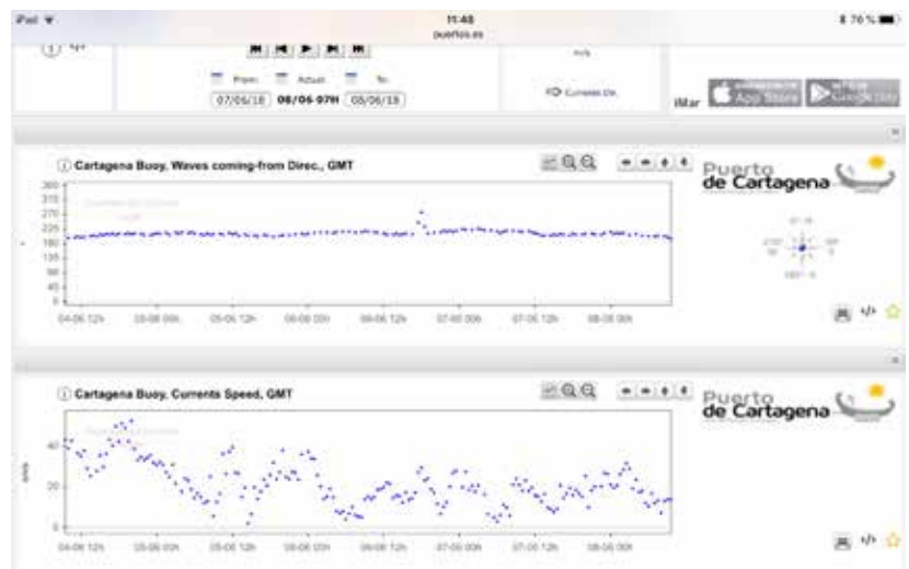
Fig. 5: Puertos del Estado's network showing live data from MOTUS Wave Buoy