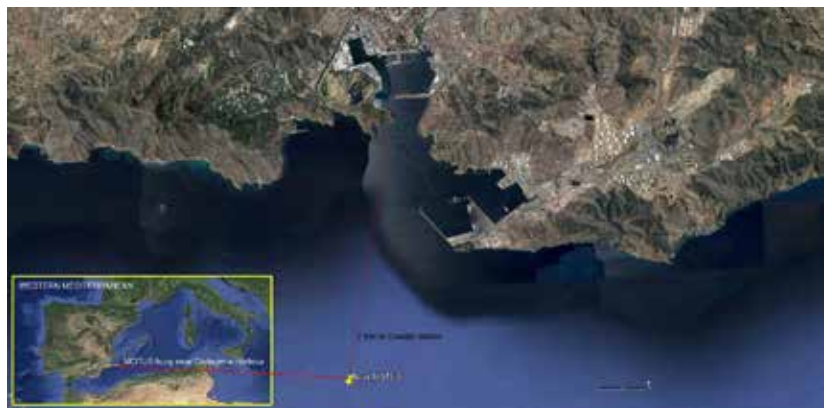
Fig. 2: Site of deployment, Cartagena, Mediterranean Sea

The Cartagena Port Authority chose Xylem to provide them with a new buoy equipped with directional wave sensors. With the support of our Spanish partner SIDMAR, Xylem delivered a Tideland SB-138P buoy