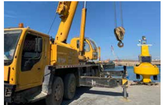
MOTUS Buoy ready for installation in Port Asilah