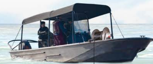
DCS on winch