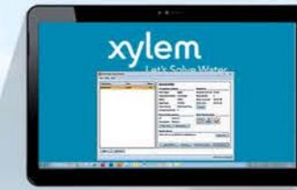
Aanderaa Real-Time Collector software for two-way communication