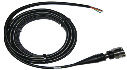
Cable 4762. Connecting cable with free end