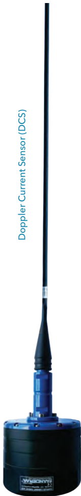
Aanderaa current sensors