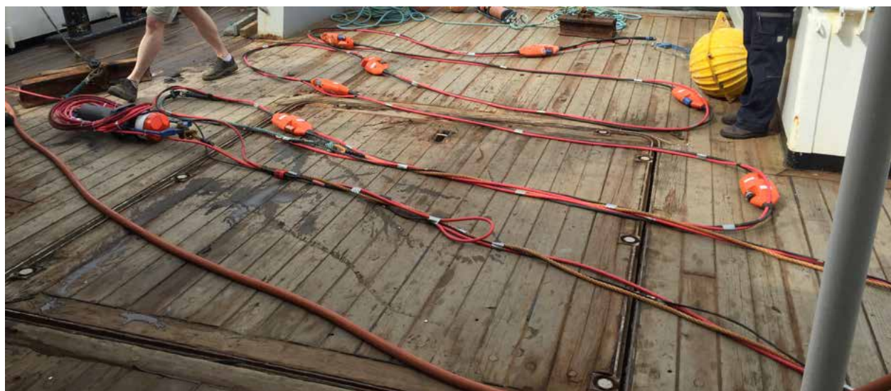
Fig. 2: SeaGuardII with sensor string

The latest upgrade of the observatory was done in June 2016. A SeaGuardII was connected to the existing sensor string and installed at the bottom replacing the previous combination of two instruments—one RDCP and one SeaGuard. Fig 2 is a photo of the new system laid out on deck prior to deployment.