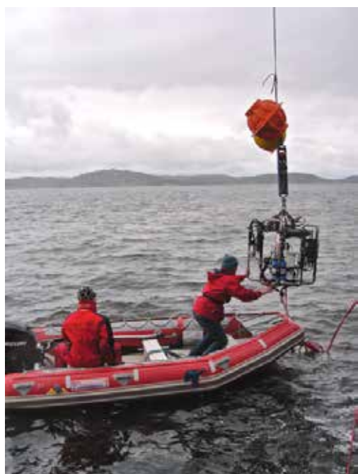
Fig 1: Deployment of 14 technologies to measure pCO 2 and pH

The Koljoeffjord observatory is part of the EMSO network of ocean observatories. It was installed in April 2011 and has served for investigations of fjord system circulation, hypoxia and the carbonate system combining a variety of sensors that cover the water column.