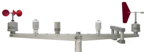
Sensor cross arm