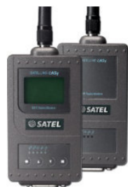
UHF Radio Modem

Communication solutions can be changed according to project requirements