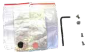
Foil Service Kit 5551. PSt 3