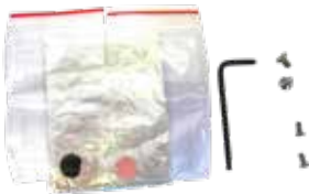
Foil Service Kit 5551. FDO701